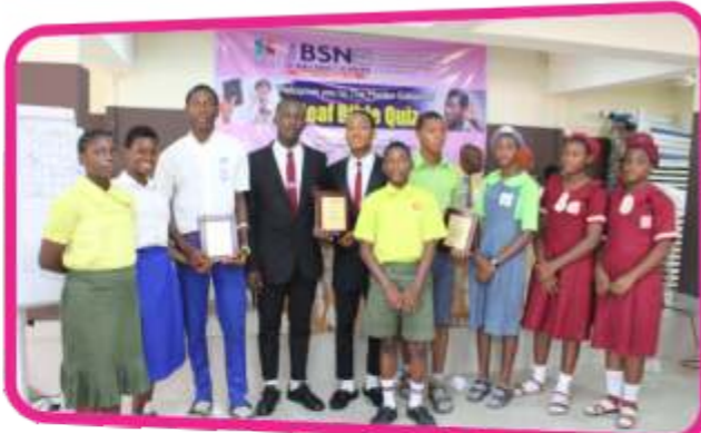
Contestants at the Deaf Bible Competition