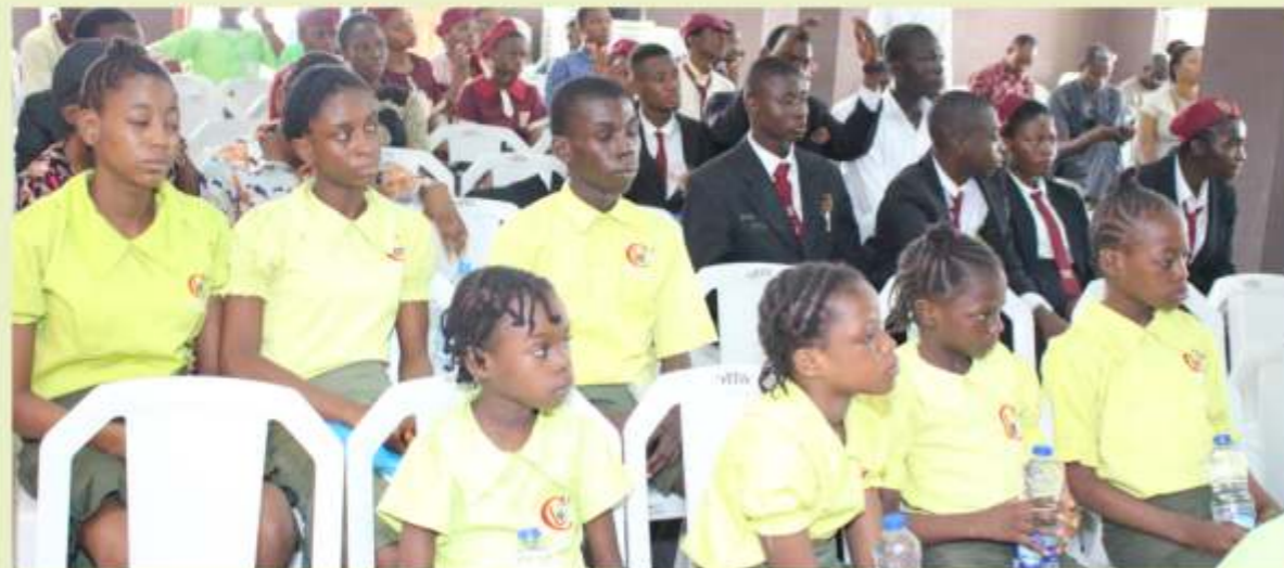
A cross section of Deaf students as audience at the Bible competition