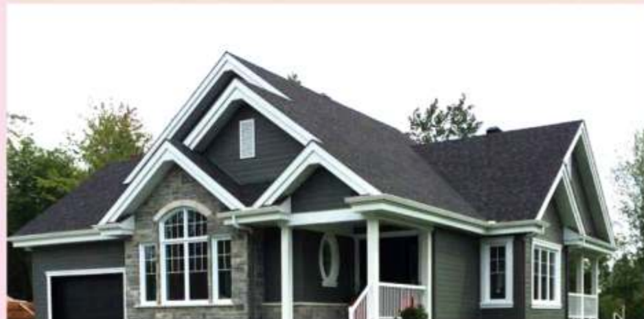
If bequeathed to an organization like The Bible Society of Nigeria it will remain like this for a long time

For over 50 years, we have remained in the service of making the Word of God available to Nigerians through Bible translation, publishing, distribution and organizing life-transforming programmes. So far, we have the complete Bible in 26 Nigerian Languages and are at the moment translating/revising the Bible in over 8 Nigerian Languages at the cost of ₦40 million per language. The money realized from such charitable bequests including shares will help us continue the good work of making the WORD of God available, affordable and FREE for the less privileged. We therefore encourage you to partner with God by bequeathing any of your assets to The Bible Society of Nigeria.