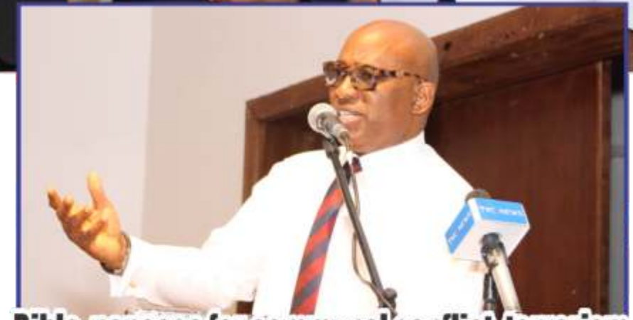
Bible; panacea for communal conflict, terrorism - Olaoye, Ayokunle