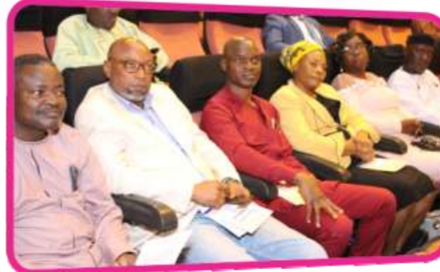
A cross section of guests at the 2020 Founder's Day Annual Lecture