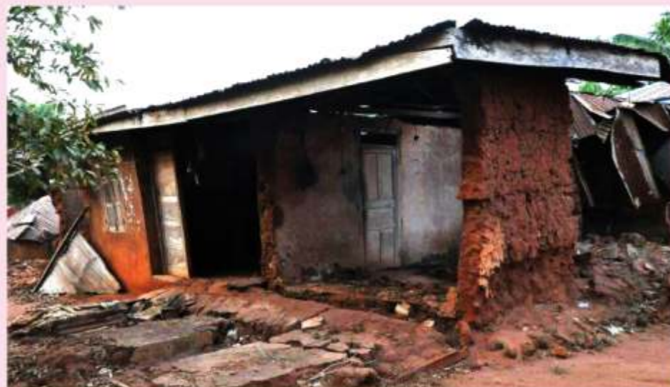
Your property may be in this state if not bequeathed to a reputable organization like The Bible Society of Nigeria

One of the surest ways to guarantee that your property and asset will remain, long after you have gone, is to bequeath it as a legacy to an organization that can take care of it. Such an organization is The Bible Society of Nigeria.